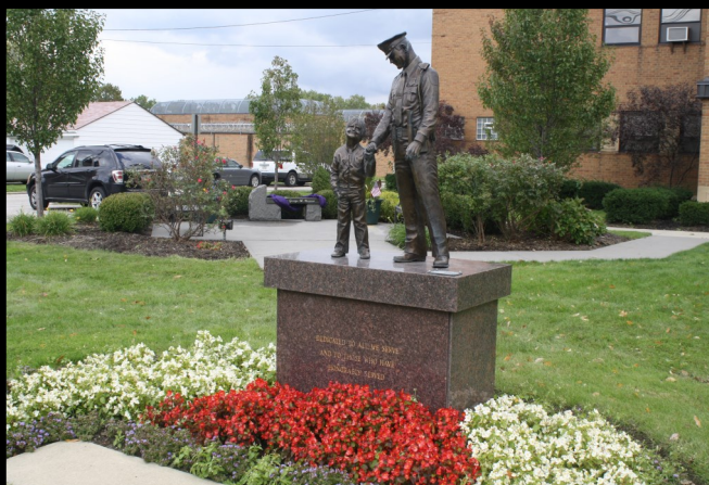
Statue of Euclid Police Officer and Child

The Narcotics & Vice Unit is staffed with four sworn, experienced, and highly motivated investigators and one of these investigators is assigned full-time to the D.E.A. Task Force. The unit investigates drug-related crimes which lead to both short and long-term investigations. All illegally possessed drugs and firearms seized by officers are processed through this unit. Narcotics Detectives serve drug related warrants on cases specific to Euclid and other jurisdictions.