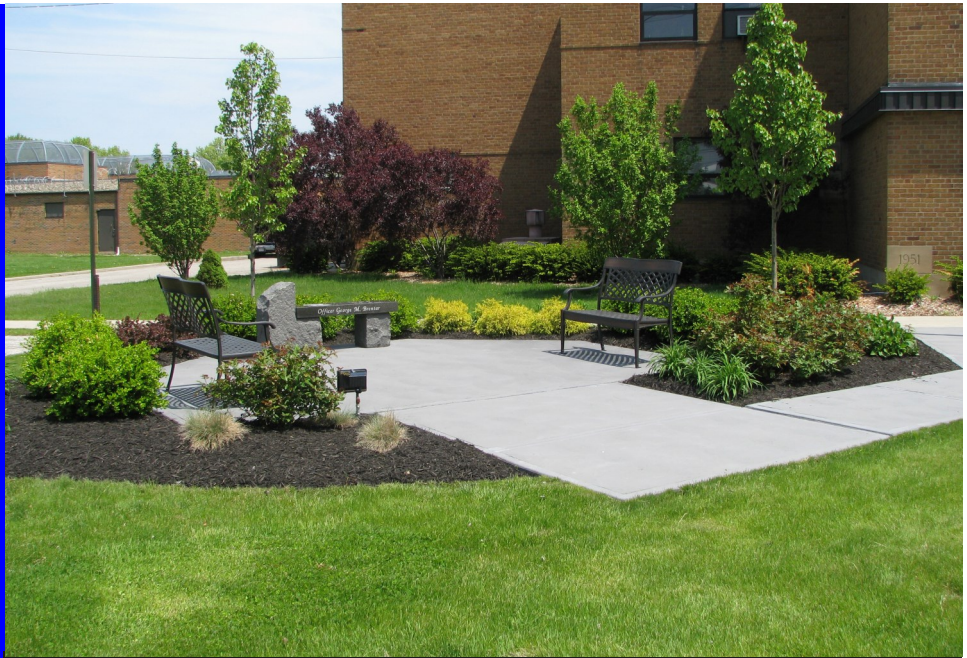
Officer George Brentar Memorial Garden

One of the main duties of the Traffic Division is selective enforcement, which is defined as the precise placement of officers enforcing specific regulations for the express purpose of preventing serious injuries due to motor vehicle crashes. Violations and their locations are obtained from crash statistics.