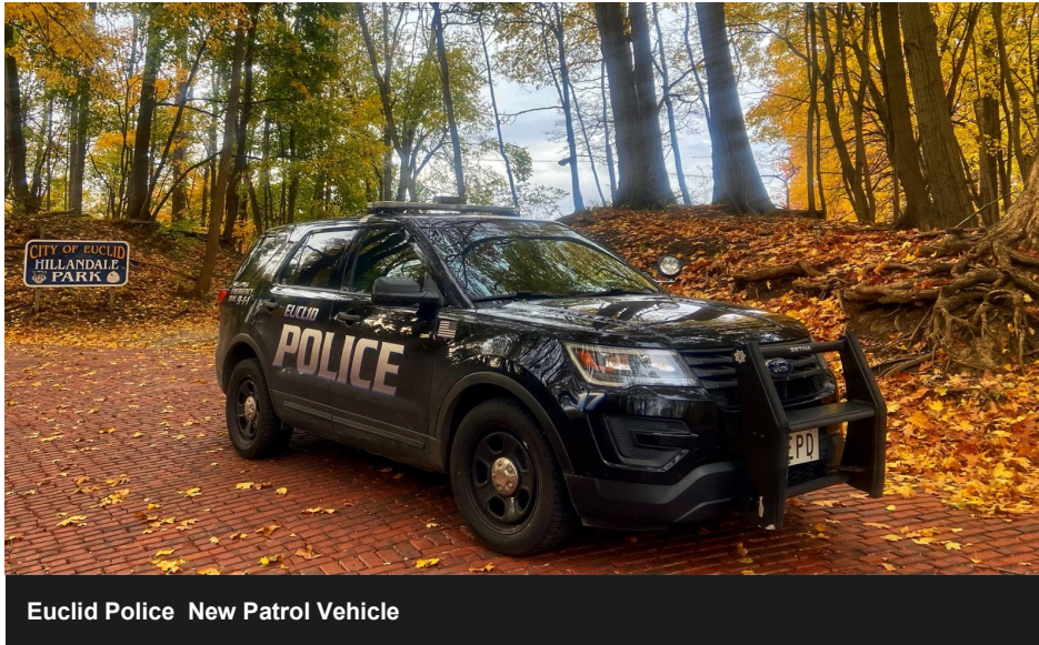
Euclid Police New Patrol Vehicle