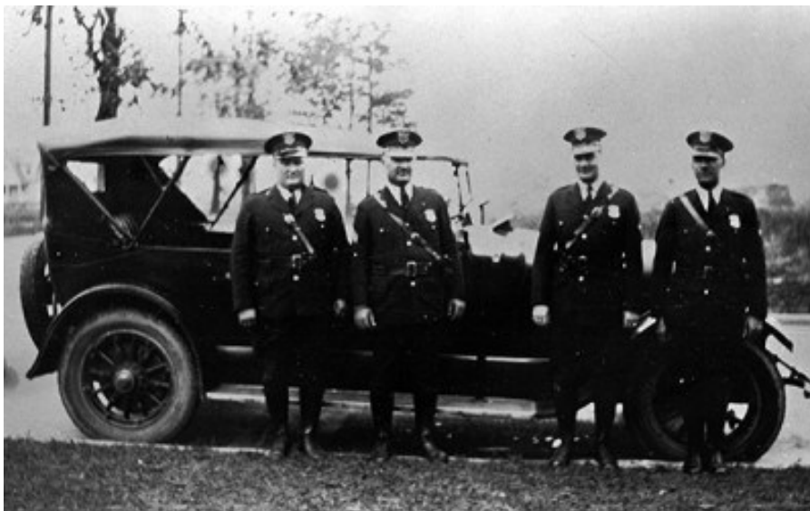
1924 Euclid Police Purchase the First Patrol Car

Designed to provide rapid, organized and disciplined responses to civil disorder and crowd control, the MFF is a platoon of officers from multiple agencies including Euclid Police that uses small squad tactics developed by the Office of Domestic Preparedness to de-escalate critical situations. Team members attend regular trainings, and focus on field force and crowd control tactics, but also firearm drills, rescues, first aid and extrication tactics.