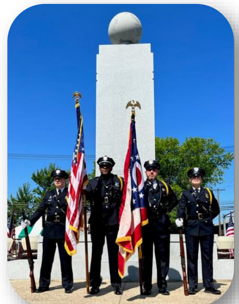
Memorial Day Parade