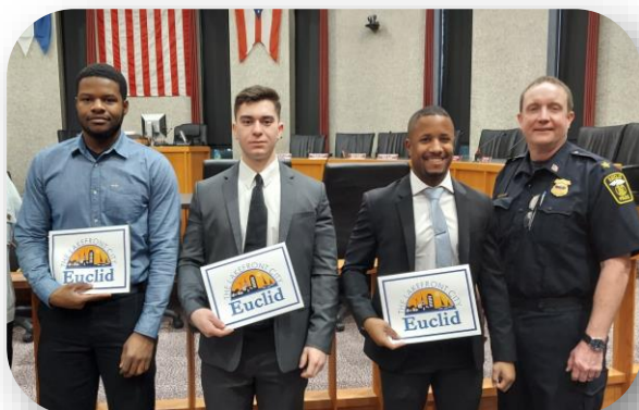
Swearing in Ceremony